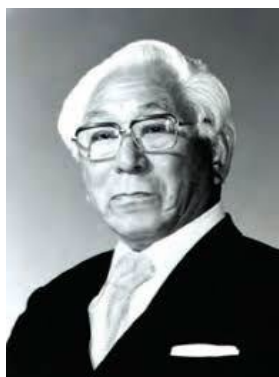
Dr. Shigeyoshi Matsumae Founder, Tokai University Educational System

The Tokai University Educational System (TES) had its genesis in a small, private high school founded in 1936 by Shigeyoshi Matsumae, based upon the educational philosophy of the Danish leader N.F.S. Gruntvig, whose ideas were introduced to Matsumae by famed Japanese educator Kanzo Uchimura. From these two men, Matsumae came to believe that schools were more than a place to acquire knowledge; they were where people could cultivate and develop their thoughts, ideas, and individuality.